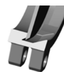
Tightness metal / metal