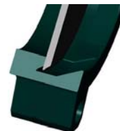
Tightness metal / metal