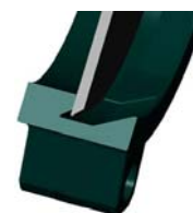
Tightness metal / metal